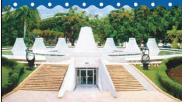
La collection du Musée du Panthéon National